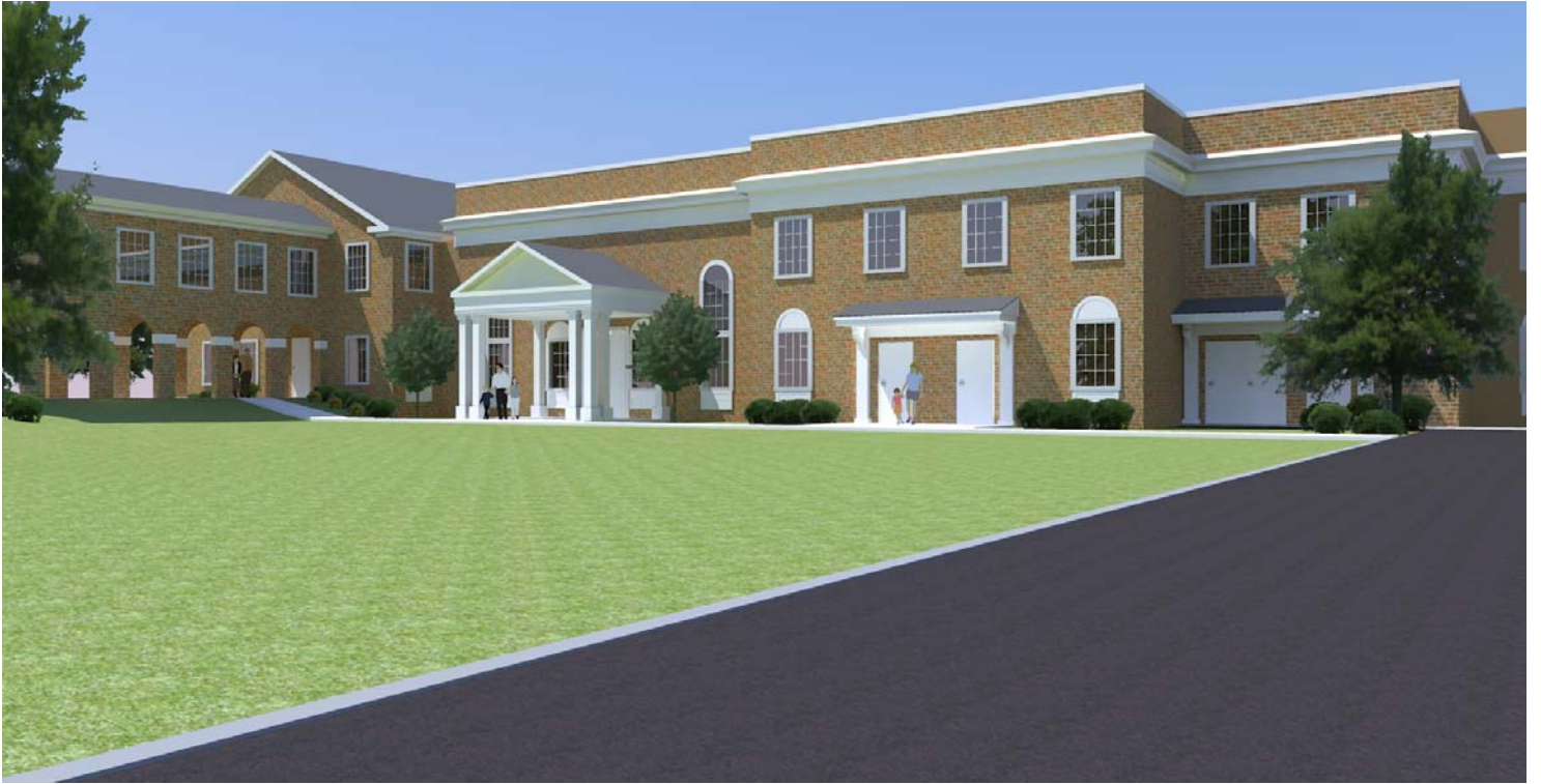
Renderings of the New Updates