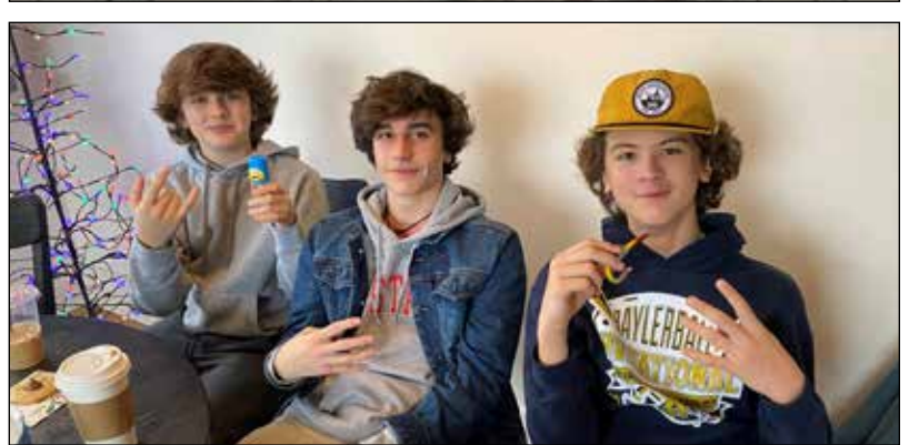
Ski Trip (February 17 – 20) Leave at 1 p.m. for Blowing Rock, NC – We will go to Sugar Mountain & Beech Mountain. Cost for anyone who will Ski & Snowboard will be $350. If you choose to ice skate, snowshoe or tube, the cost will be $250. If there are multiple siblings or friends that join us, each will get $25 off their trip. Please sign up and pay by January 15.