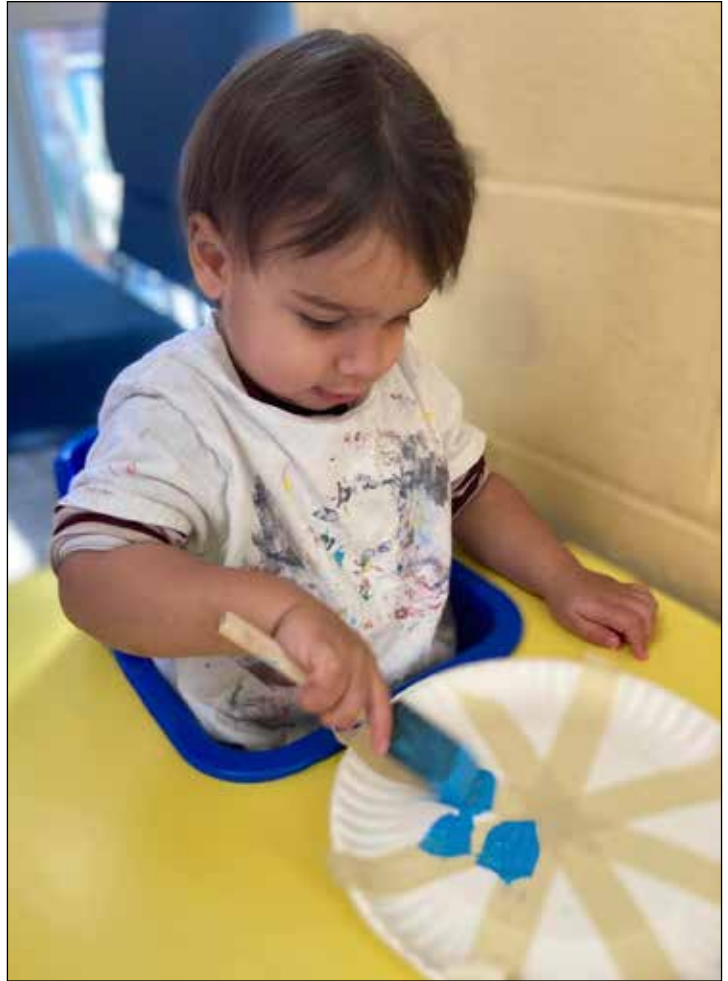
Painting snowflakes in Infant 2.