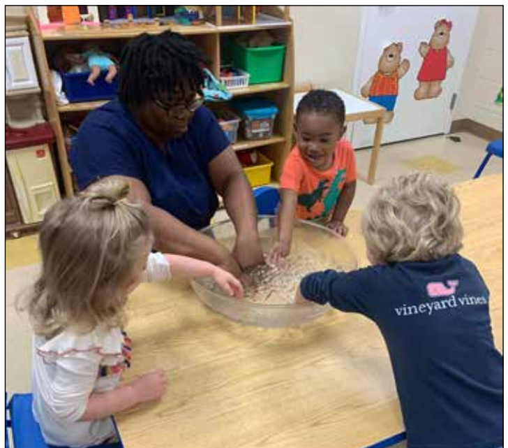
Science Spot in 2KA, where children learned by a fun and messy science experiment about how arctic animals stay warm!