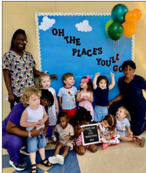
Snapshots from our first days of preschool day at the Child Development Center